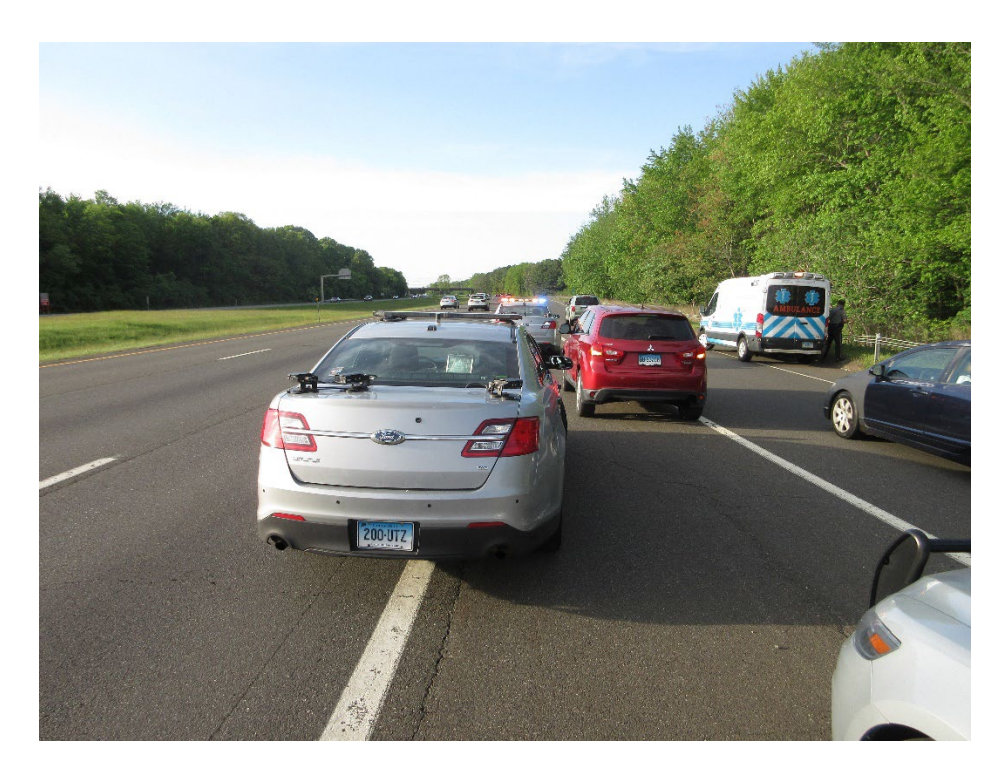
[Trooper Poirier's cruiser]